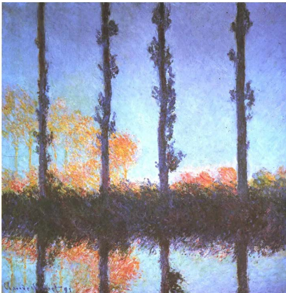
Claude Monet - I quattro alberi, 1891, Metropolitan Museum of Art